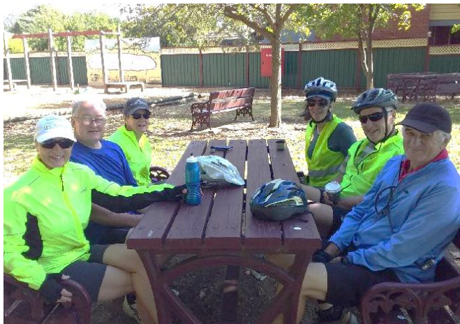
Slics cycle group after ride round Beac Lake

The SLICS cycle group will be going to Melbourne to ride along the Bay, early in May . Details can be obtained from Sue. Ring 0419136704 or email sschram@bigpond.com for details